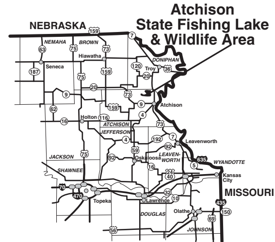
General Area Map

Equal opportunity to participate in and benefit from programs described herein is available to all individuals without regard to race, color, national origin, sex, religion, age or handicap. Complaints of discrimination should be sent to Office of the Secretary, Kansas Department of Wildlife and Parks, 1020 S Kansas Ave. Suite 200, Topeka, KS 66612-1327 03/03