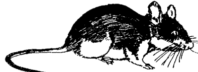
WHITE FOOTED MOUSE